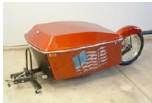
Single Wheeled Trailer