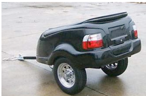
Two Wheeled Trailer

Most trailers have two wheels but there are a few popular brands that use a single wheel. The advantage of the single wheeled trailers is that the trailer leans with the motorcycle and tracks in the same wheel path.